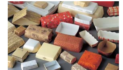
Stacking SD mould products

This produces tapered trays for stacking using a variety of materials in a variety of shapes and sizes.