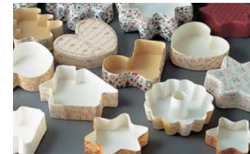
Large flexible mould products

This flexible system makes it possible to create any shapes by using our proprietary moulding system.