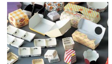
Multifunctional stacking mould products

This produces tapered trays for stacking using a variety of materials in a variety of shapes and sizes.