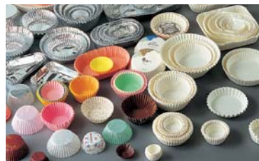
Thin paper multi-press mould products

This system produces a great variety of forms, for example tulip-shaped baking cups.