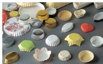
Composite paper press mould products

This system produces many cups with one press which saves cost, like glassine cups.