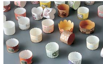
Muffin cup mould products

We can produce a wide variety of muffin cups which are standard items in any bakery.