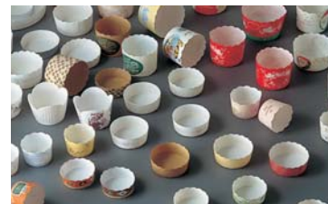
Tubular press mould products

This system produces jelly and mousse containers from composite paper. There are also many other possible applications.