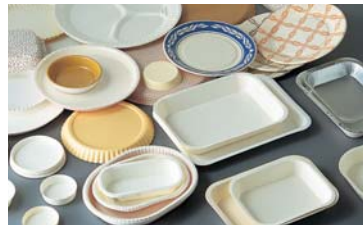
Board press mould products

This system produces shallow, strong paper trays such as paper plates and food containers.