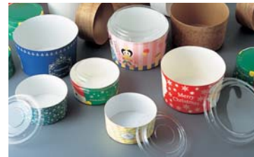
Tubular board mould products

This system produces large paper cups ideal for assortments of sweets or foods.