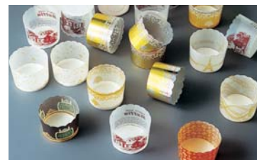
Tubular composite paper mould products

We can produce a wide variety of muffin cups which are standard items in any bakery.