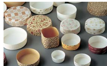
Shallow tubular mould products

This press makes it possible to make cake cups with a center barrel, such as for making chiffon cakes.