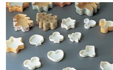
Small flexible mould products

This flexible system makes it possible to create any shapes by using our proprietary moulding system.