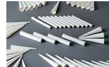
Spiral mould products

This produces cylindrical or conical forms paper for the cercle or centers when making cornets.