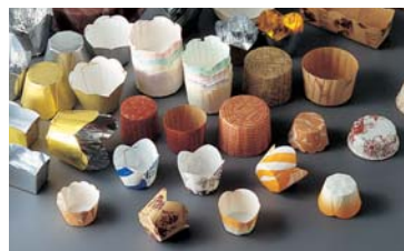
Thin paper press mould products

This system produces shallow, strong paper trays such as paper plates and food containers.