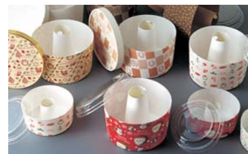
Tubular mould products with center barrel

This system produces large paper cups ideal for assortments of sweets or foods.