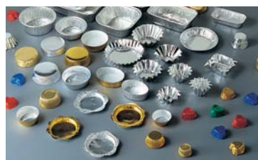
Aluminum foil press mould products

This system produces cups that are composite, for example PET and paper, meaning that we can produce even more functional containers.